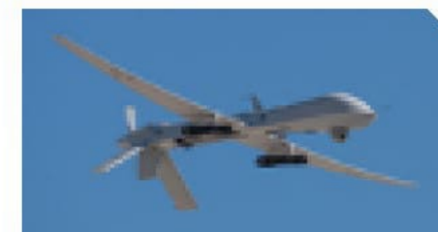
Predator Unmanned Aircraft