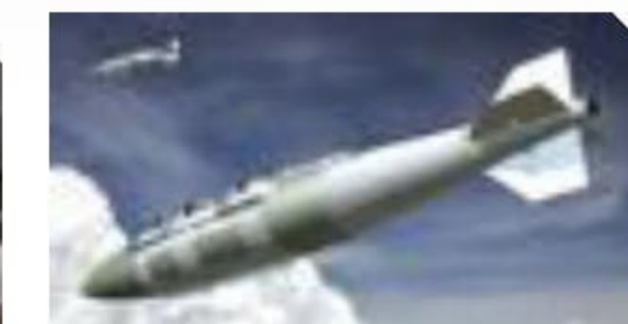
Joint Direct Attack Munitions