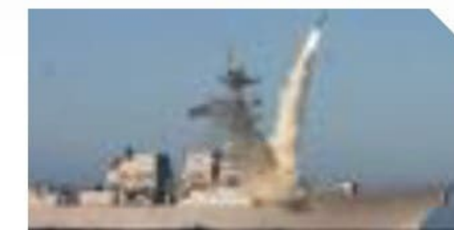
Tomahawk Cruise Missile